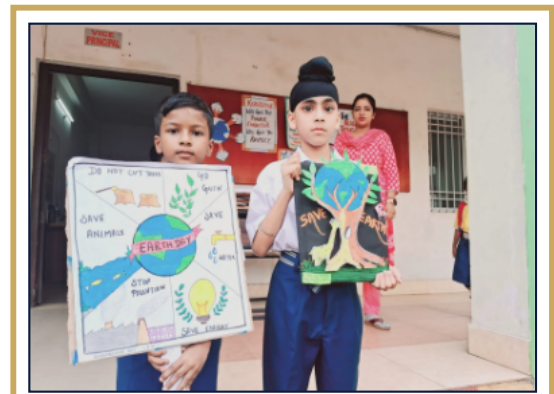
EARTH DAY — LEARNING BY DOING

In keeping with NEP 2020, Aparna Public School facilitates experiential learning through a multilayered curriculum approach based on the multiple-intelligences theory. Learning programmes are thoughtfully planned in an enjoyable manner — indoor and outdoor games, storytelling sessions, panel theatre, puppet shows, project work, origami, field trips and school cinema — with a strong focus on the development of listening, speaking, reading, writing and arithmetic skills.