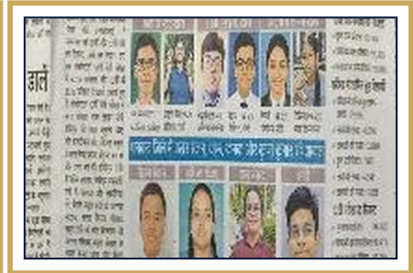
Board results coverage