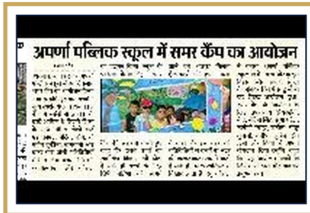
Summer Camp at Aparna