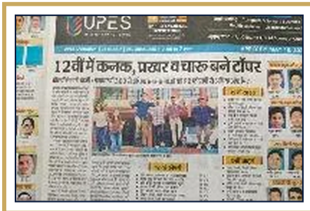
Class XII toppers felicitated