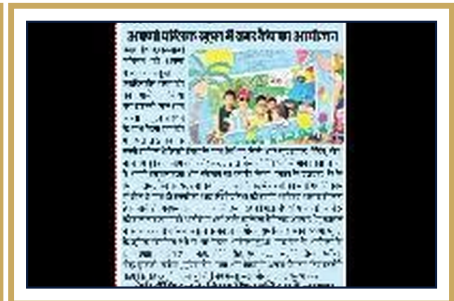
Summer Camp — press feature