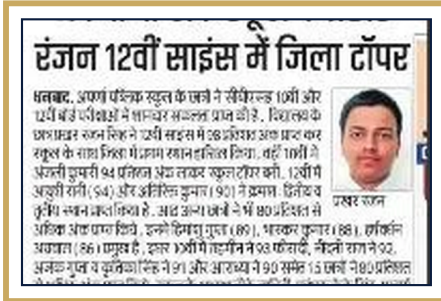
District Topper — Class XII Science

From district toppers to vibrant summer camps, the achievements of our students are regularly celebrated in the leading newspapers of Dhanbad and Jharkhand. A few press glimpses: