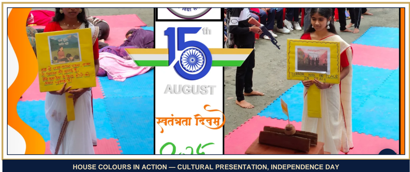
HOUSE COLOURS IN ACTION — CULTURAL PRESENTATION, INDEPENDENCE DAY

Approved uniform and book vendor details are shared with all parents well in time through group SMS and the Parents' Corner on the School website. Parents are advised to procure the complete set before the session begins so that children are appropriately turned out from the first day.