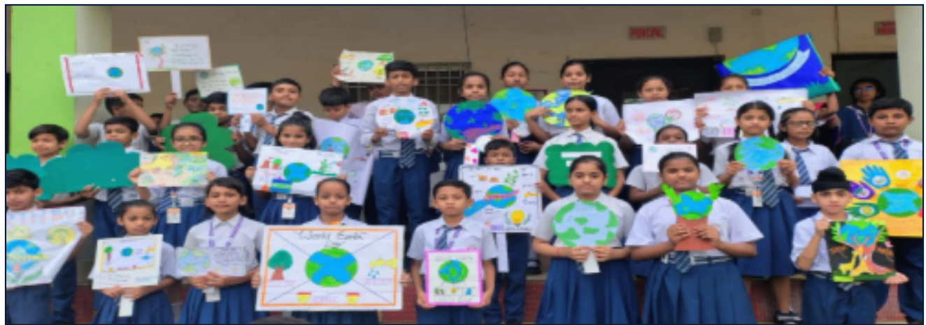
EARTH DAY CELEBRATION — YOUNG GUARDIANS OF THE PLANET

The School office operates during working hours on all school days. Parents wishing to meet the Principal or teachers are requested to take a prior appointment through the office or the Parents' Corner, so that meetings can be attended to without disrupting class time. Visitors are welcome on campus during school hours through the reception.