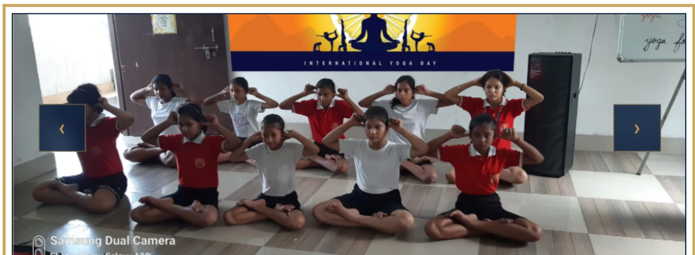
INTERNATIONAL YOGA DAY — MINDFULNESS IN EVERY CLASSROOM

“We open windows for our students to follow their dreams and take pride in what they do.”