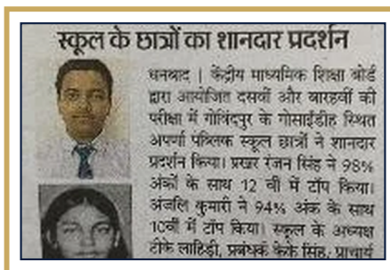
Outstanding Class X & XII results

Press clippings courtesy: Dainik Jagran, Dainik Bhaskar, Hindustan and other leading dailies of Dhanbad.